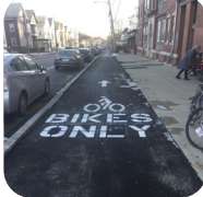
Cycle Track / Protected Bike Lane