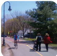
Mixed Use Path