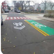
Neighborway (Quiet Useful Street)