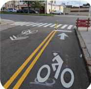
Single Direction Bike Lane