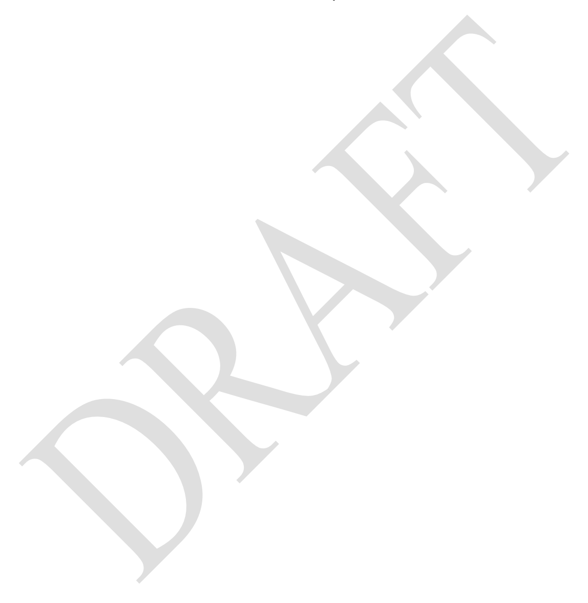
Table 4 – Citizen Participation Outreach