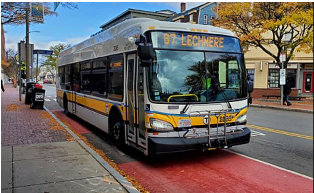
MBTA bus Wikiwand