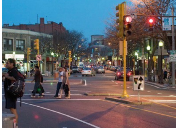
Somerville by Design

The subcommittee was an early proponent of making temporary COVID-19 parking removals permanent to allow for enhanced pedestrian safety, transit access and bike safety in the Holland and College area. The subcommittee also recommended the adoption of permanent bike and bus lanes in the area rather than peak time bus lanes. The subcommittee communicated these suggestions to the Mobility Department. The City eventually incorporated both suggestions into the Holland and College Avenue project.